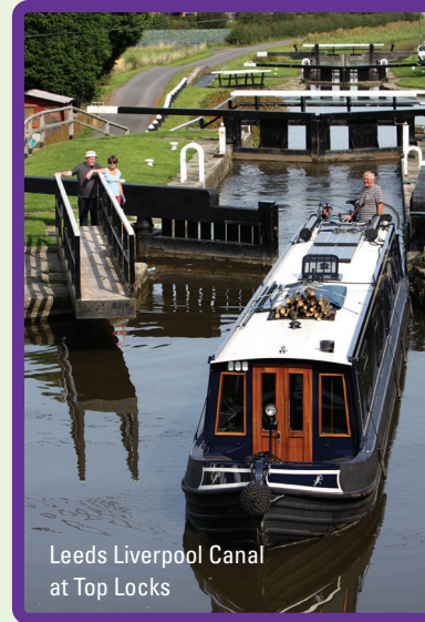
Leeds Liverpool Canal at Top Locks