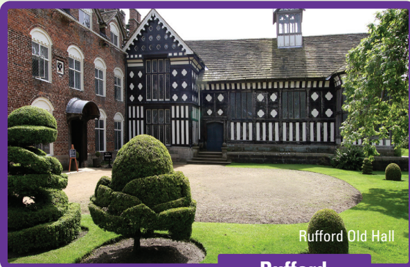
Rufford Old Hall