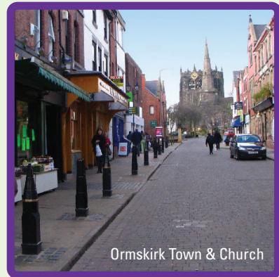
Ormskirk Town & Church

Rufford is the station to use for visiting the wonderful National Trust Property, Rufford Old Hall . This property was home to the Heskeths for 500 years and its Great Hall was once the stage for William Shakespeare before he was famous. The Hall is just a short walk from the station.