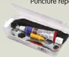
Puncture repair kit