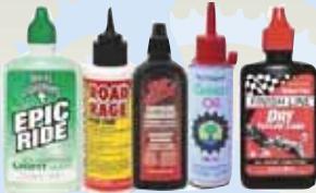
Oil & lubricant