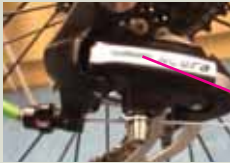
Rear Mechanism/ derailleur