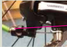
Rear Mechanism/ derailleur barrel adjuster