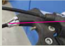
Brake barrel adjuster